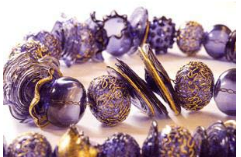
Nirit Dekel, necklace with disk, container and pomegranate beads, glass

Toronto Outdoor Art Exhibition (TOAE), July 9, 10 and 11, 2010,