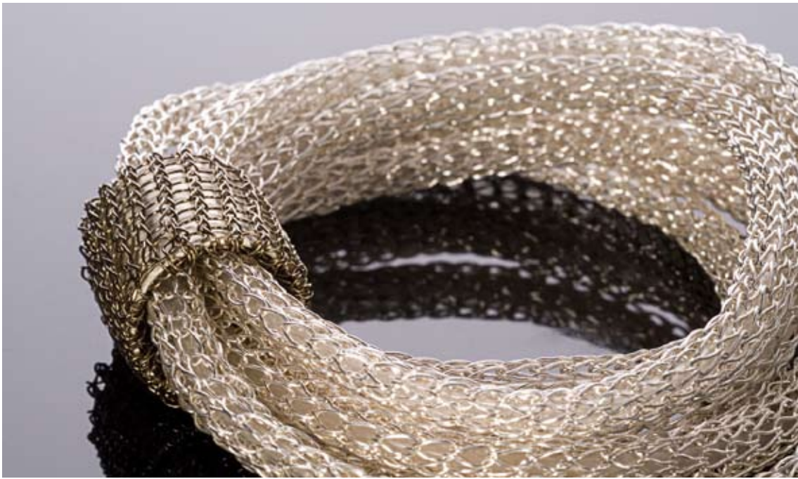
Sarit Assaf, knitted bracelet, silver.