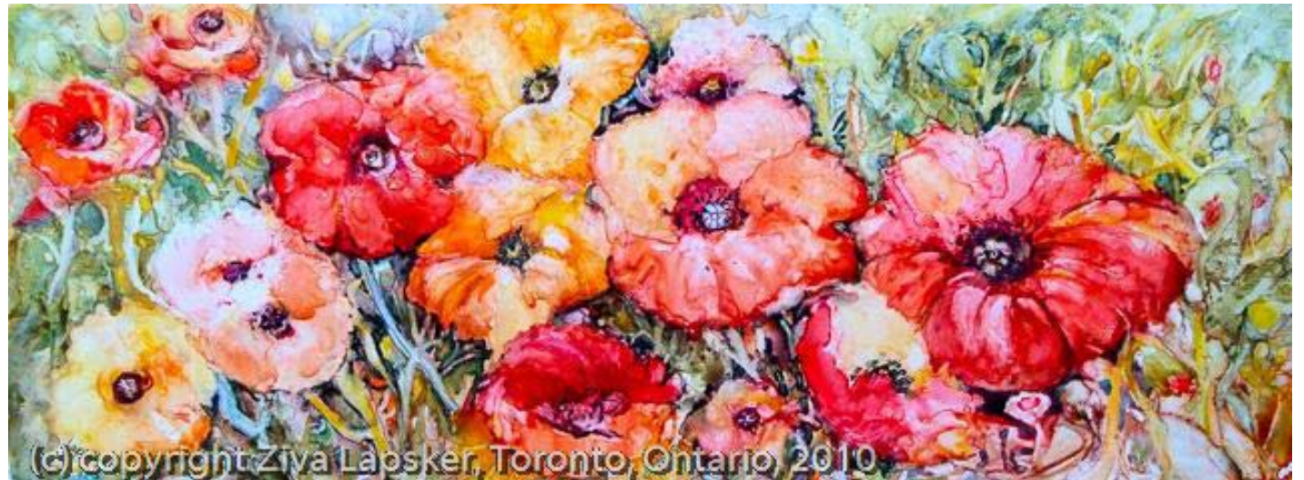
Ziva Lepsker, Flowers, Watercolours

However, when looking at Ziva's flower fields and landscapes, you can appreciate the richness of the medium, and her playful con-